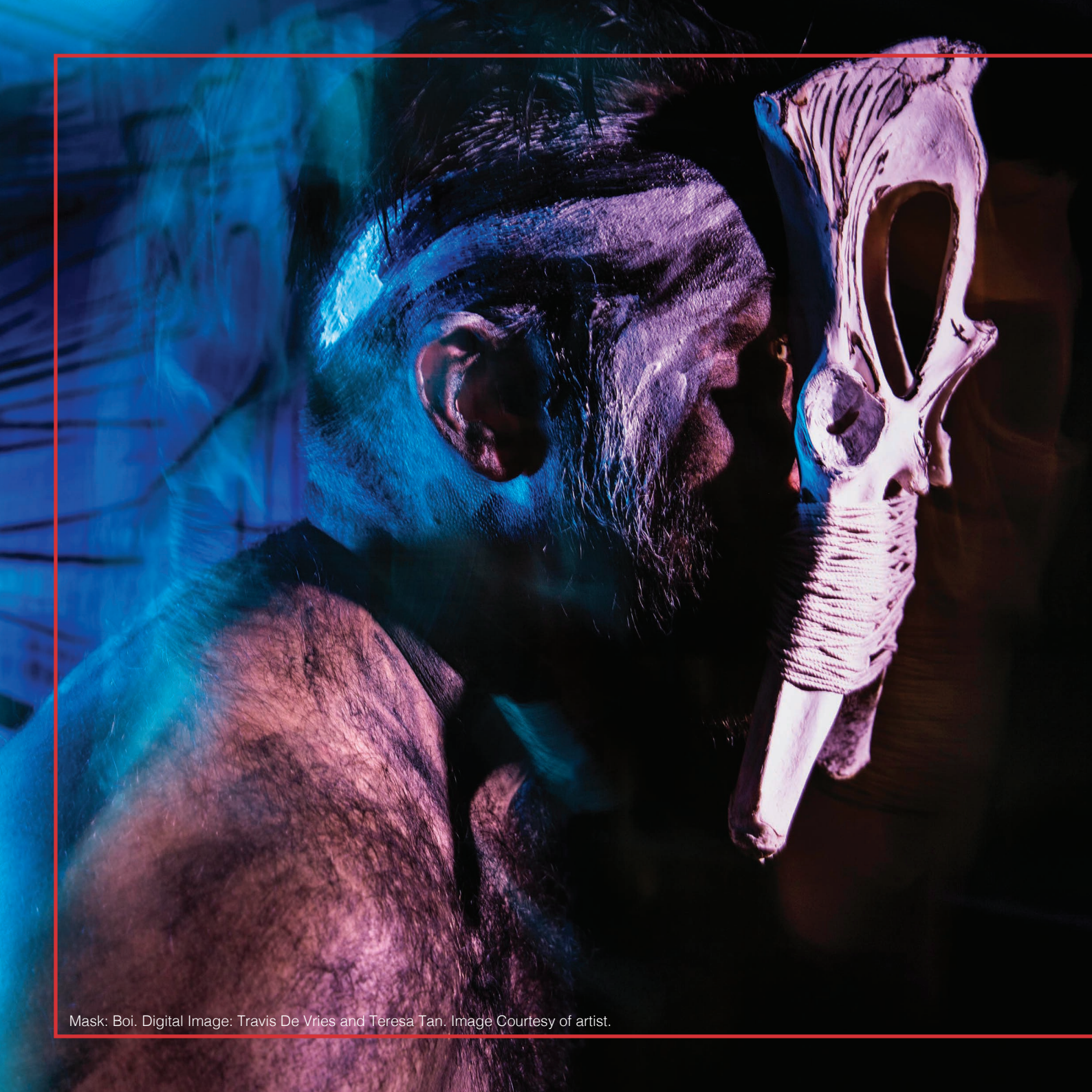
Mask: Boi. Digital Image: Travis De Vries and Teresa Tan. Image Courtesy of artist.