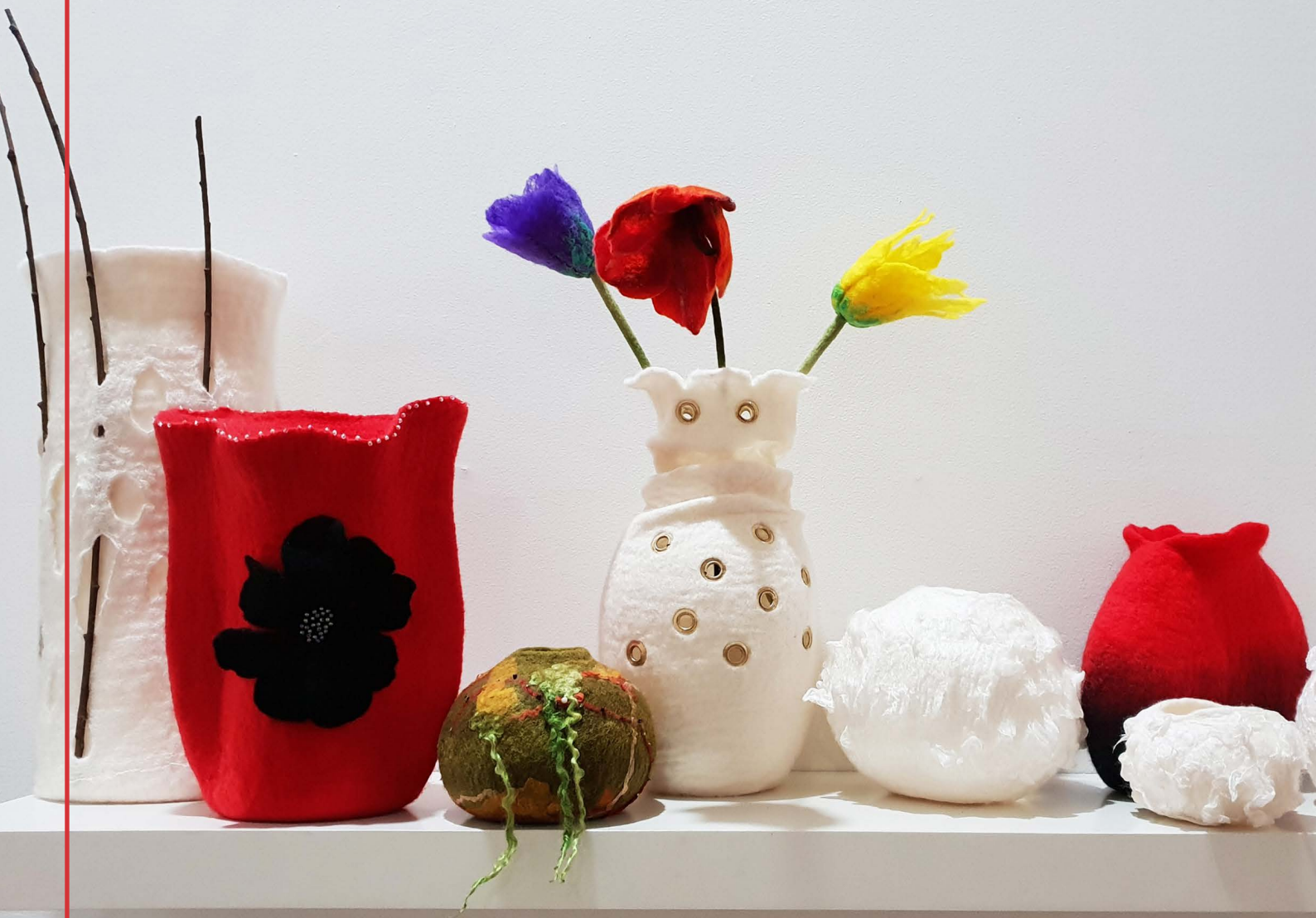
Work by Cecily Walters & Toni Morrison. Home Ground Exhibition 'Imperfect' WPC 2018.