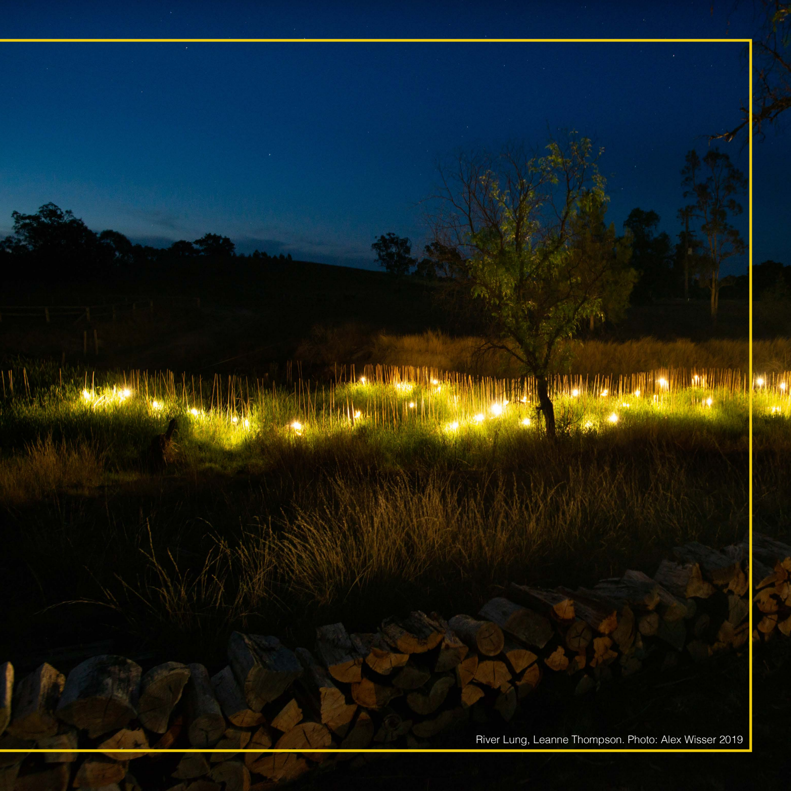
River Lung, Leanne Thompson.